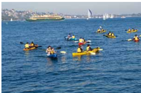
Kayaking on Chowder Bay, Sydney Harbour